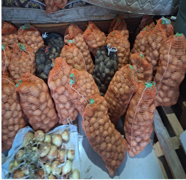
Figure 9: harvesting time for the first batch