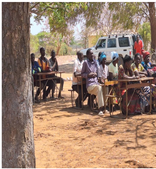
Some village head men and others listening to the DC