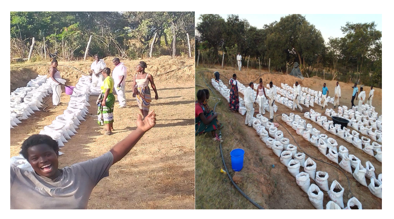
Fig 5: Happy youths watering bags