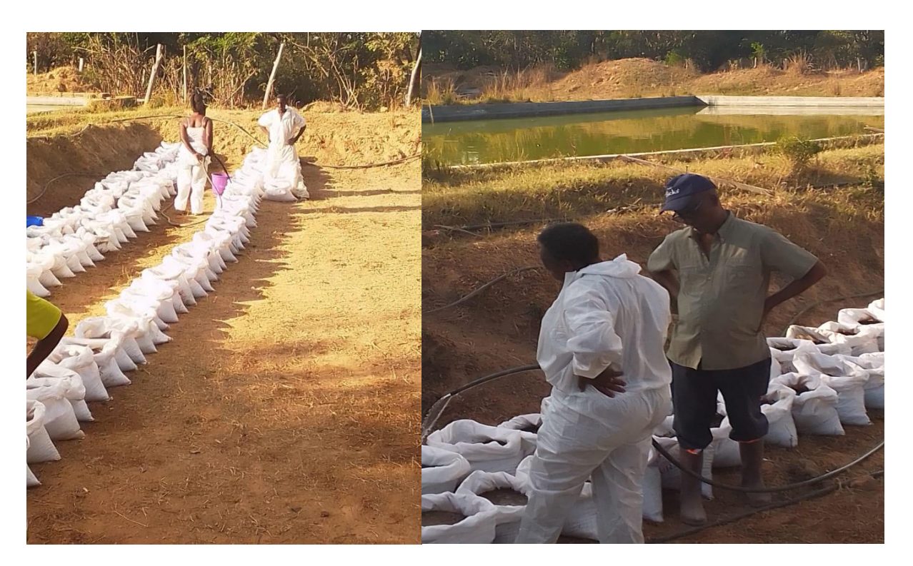
Figure 3: Youths transferring packed (grow)bags