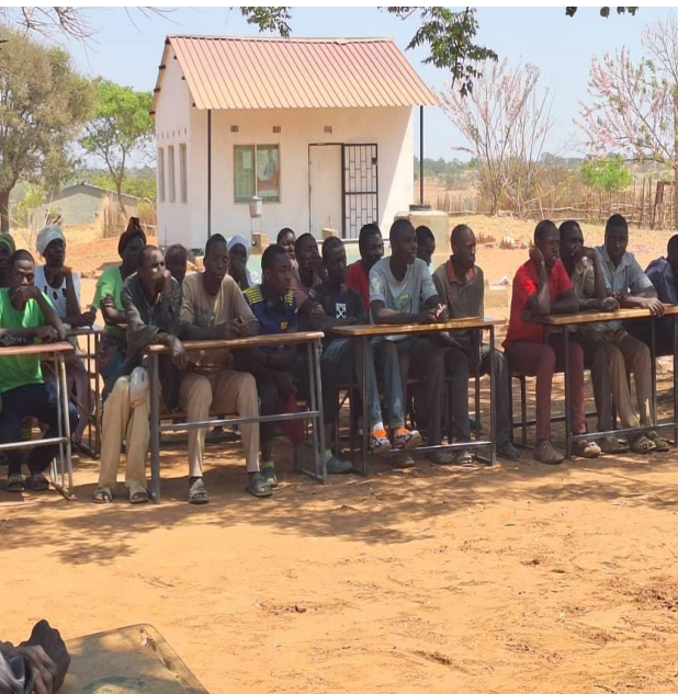
Fig Village headmen attending meeting